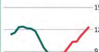
Merchandise exports, as % of world total