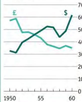
Share of currencies in globally disclosed foreign-exchange reserves, %