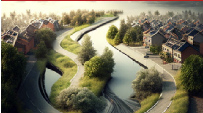
AI images from the tool Midjourney

Following this exercise, students chose one of their prompts and evaluated the image outputs of that prompt based on criteria discussed in class. After a deeper evaluation of the images, they chose one of these creations and turned it into a 3D model to further meet the course’s core learning objectives.