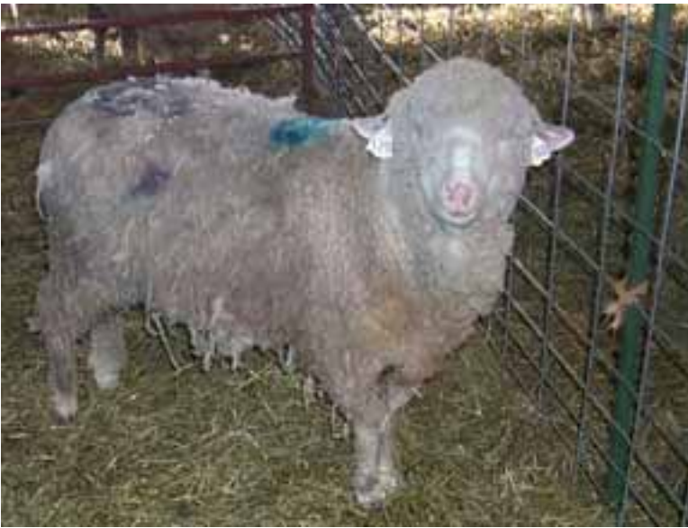
8 - This ewe has ragged wool because it has been rubbing and kicking at keds. Large numbers can cause anemia and the excreta from the keds can stain the wool.