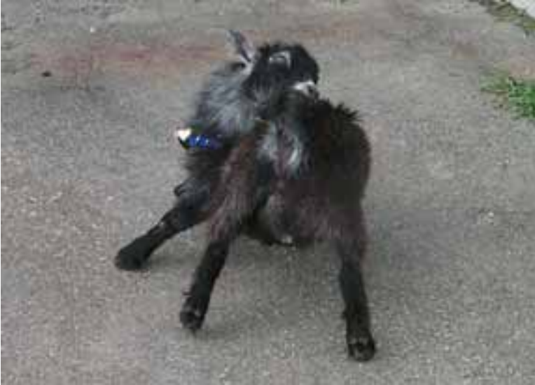
7- This goat is frantic in its attempts to chew at the lice crawling on its back.