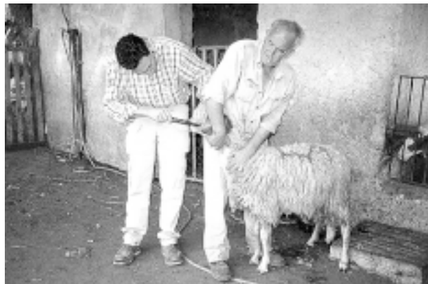
Figure 2 Ingestion of Rumen Bolus