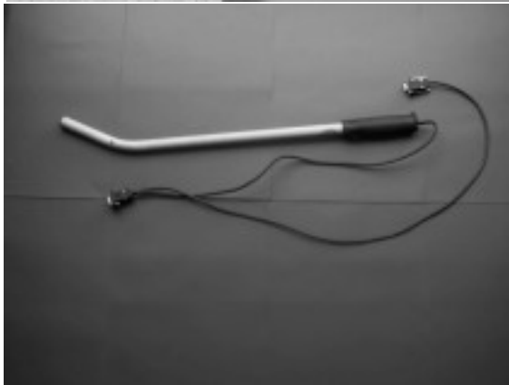
Figure 4 Stick Antenna.