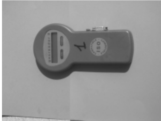
Figure 3 Portable Reader.

When it is stimulated by the Portable Reader (Figure 3) emitting low frequencies electromagnetic waves, the microchip transmits a unique and inviolable number. The Stick Antenna (Figure 4) allows the production controller to identify each animal without having to closely approaching it as shown in Figure 5. The Portable Reader is connected to the Records Keeper (Figure 6), in fact a field computer, which associates the microchip number with the animal identification and allows the operator to enter the production and reproduction records for each animal in the flock.