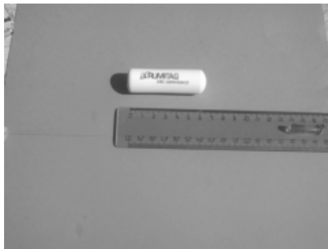
Figure 1 Rumen bolus microchip.

The animals are identified using individual tags and ear tattoos immediately after birth and at six months of age the lambs receive the rumen bolus (Figure 1), which is ingested orally (Figure 2) and will permanently lodge in the animals' reticulum. The rumen bolus is a ceramic capsule (cylindrical shape and weighting 70gr) containing an ISOHDX type transponder of 32 mm. The transponder is a passive battery-less device functioning between - 25°C and + 85°C.