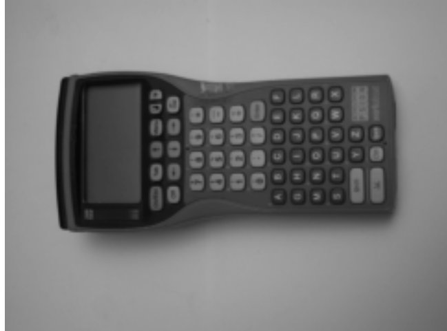
Figure 6 Records Keeper.