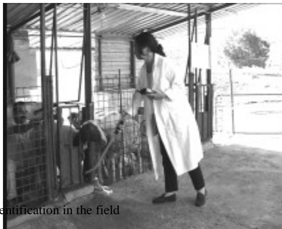
Figure 5 Reading animal identification in the field