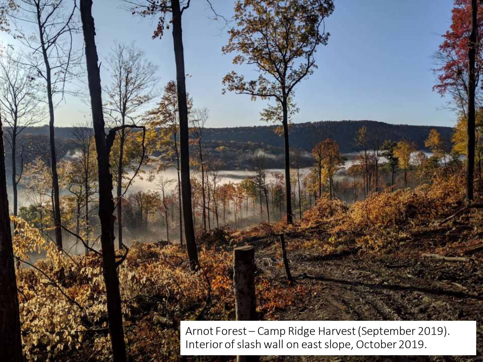
Arnot Forest – Camp Ridge Harvest (September 2019). Interior of slash wall on east slope, October 2019.