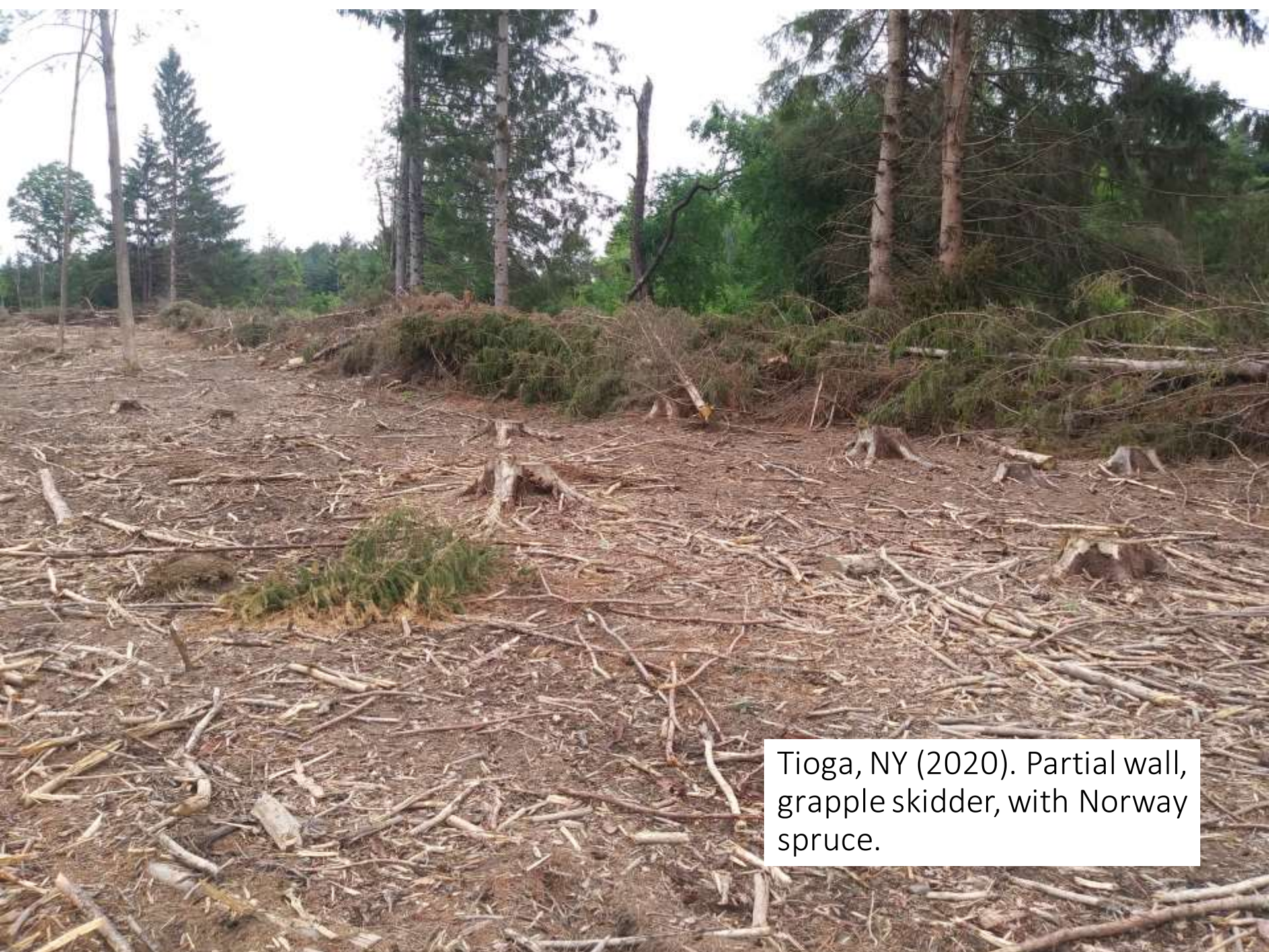
Tioga, NY (2020). Partial wall, grapple skidder, with Norway spruce.