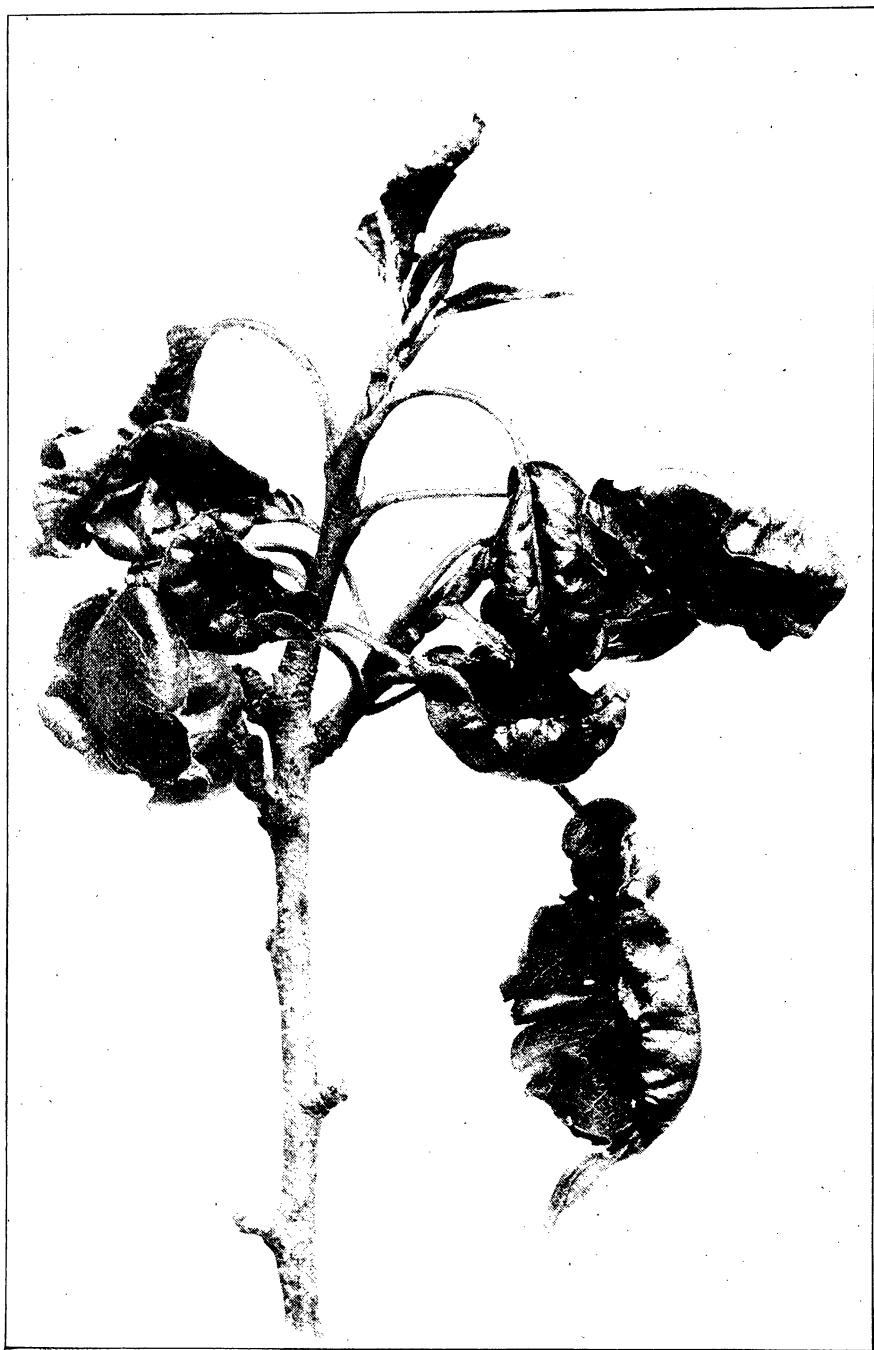
PLATE IV.—INFLUENCE OF ADULT THRIPS ON PEAR FOLIAGE.