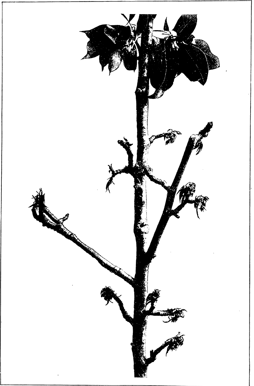
PLATE I.— KIEFFER BRANCH SHOWING "BLIGHTING" OF BLOSSOM-CLUSTERS DUE TO WORK OF THE THRIPS.