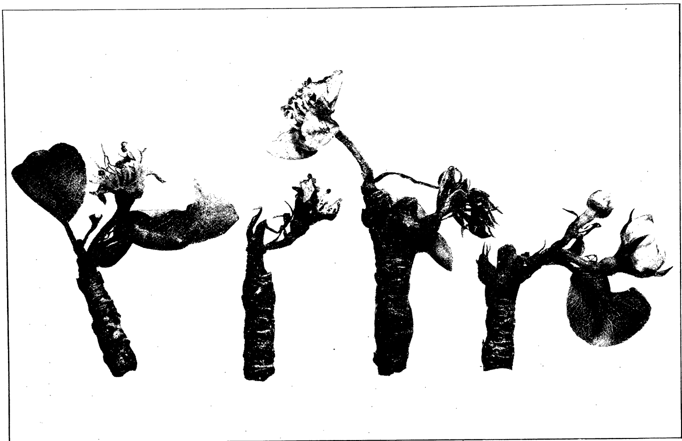
PLATE II.—KIEFFER BLOSSOM-CLUSTERS SHOWING INJURY CAUSED BY ADULT THRIPS.