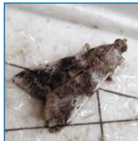
Cranberry fruitworm, length 1/2" photo not to scale

You probably have damage from Cranberry and/or Cherry Fruitworm moth caterpillars