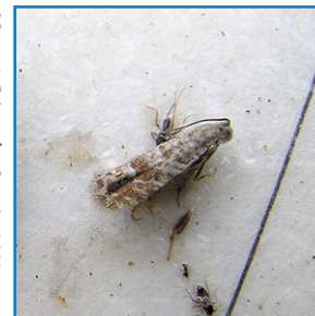
Cherry fruitworm, length 1/4" photo not to scale

Two common moths that spend their caterpillar lives in blueberries are Cranberry and Cherry fruitworms.