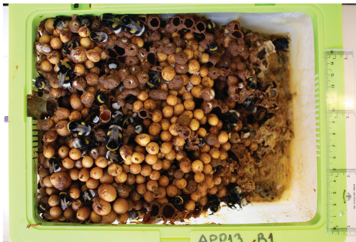
Photos 3 & 4 Buff-tailed bumble bee colony performance was tracked by weighing the colonies before and after focal crop bloom (left) and by counting all bees and brood (right) at the termination of bloom.

protect pollinators in Europe? These are the topics for the seventy-second Notes from the Lab , where I summarize “ Pesticide use negatively affects bumble bees across European landscapes ,” written by Charlie Nicholson & Jessica Knapp and colleagues and published in the journal Nature [2023].