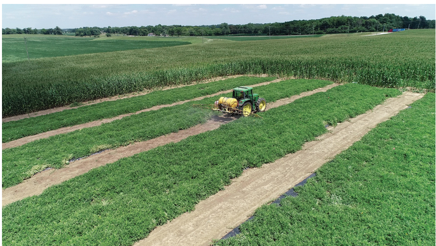
Photo 1. One of the experimental watermelon plots used for the 3-year study. At each of five sites, one watermelon and one corn plot were conventionally managed (CM) with pesticides in the way that most farmers currently use them, while another set of watermelon and corn plots were managed using Integrated Pest Management (IPM). Pesticides were only used on the IPM plots when pest populations exceeded a predetermined economic threshold (see Figure 1).

This all sounds good in theory, but is there real-world evidence that practicing IPM and using fewer insecticides can improve yield in a pollination-dependent crop? If so, is increased yield due to greater numbers of bee pollinators? And what about a crop that doesn't rely on pollinators? Can farmers improve their bottom line by taking an IPM approach, or will they frequently surpass economic thresholds such that impacts on yield occur? These are the topics for our forty-ninth Notes from the Lab, where we summarize "IPM re-