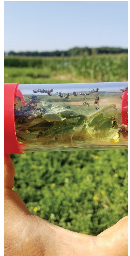
Photo 3. A sample of bees that were visiting IPM watermelon flowers. Note the large number of black and green sweat bees (family Halictidae) in the sample. Bee visits to watermelon were 99% greater in IPM vs. CM plots.

Economics often drives decisions by humans, and the study by Pecenka and colleagues shows very nicely that economics can encourage more sustainable farming practices regard-