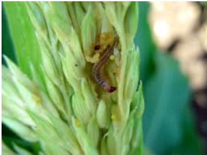
ECB feeding on emerging tassel