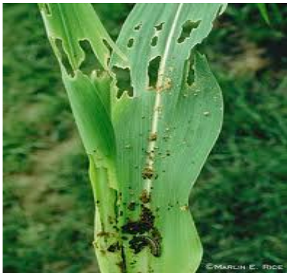
CEW and FAW feeding damage