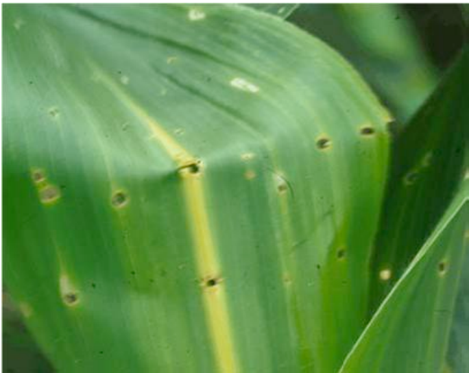
ECB pinhole damage