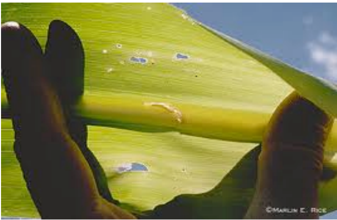
ECB "window pane" damage