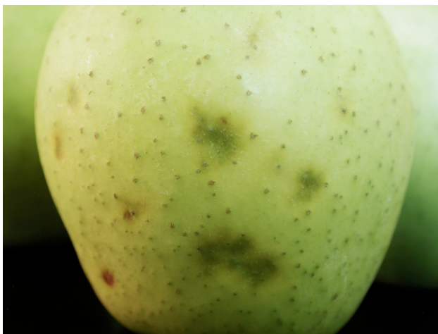
Images of more recent injury from the stink bug complex (left image) and earlier seasonal feeding injury (right image) to Golden Delicious apple. September 26, 2012