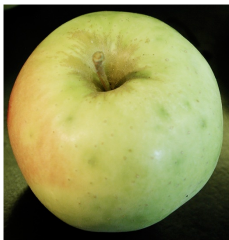
Very recent feeding beginning to appear