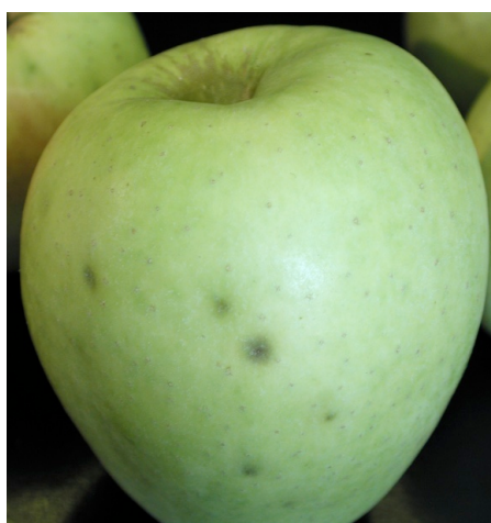
Small dark green skin SB feeding expression