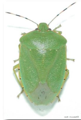
Green Stink bug, Acrosternum hilare