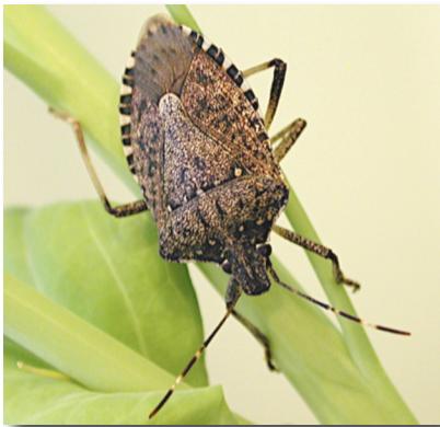
Brown marmorated stink bug, Halyomorpha halys

Feeding site expression typical of stink bug as classified by Mark Brown 1 : Feeding 'tubes', white crystalline sugar residue, very small hole in center of discolored sites and feeding sites with discoloration and depressions.