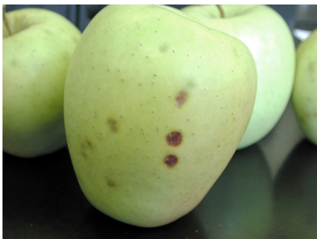
Red skin expression

Examples of four distinct types of damage we are seeing in Ulster & Orange, NY (26 th Sept. 2012). Injury along orchard edges in these blocks exceeding 4% with >1% injury in the center of blocks noted.