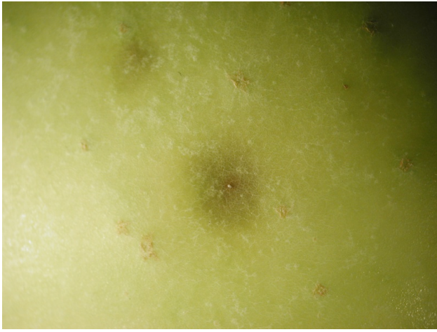
Dark green skin SB feeding expression close-up