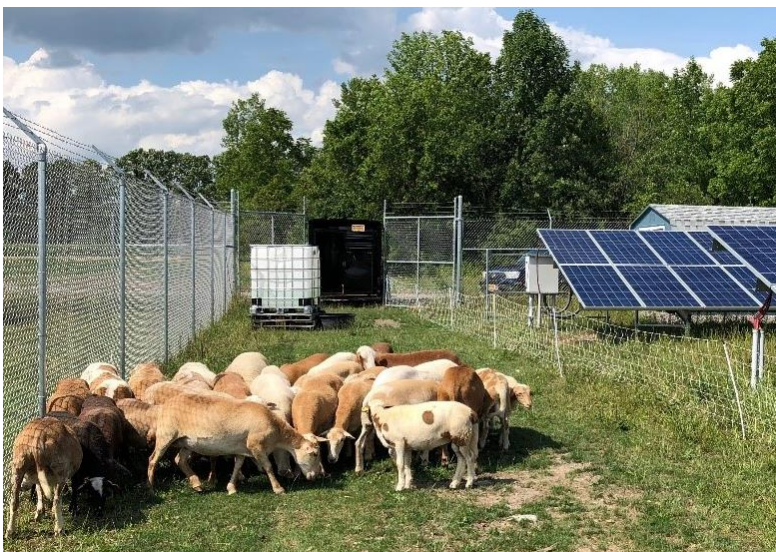
Figure 3. Water access and Electronet ® .

The site was divided by permanent and Electronet ® fencing into 4 plots for the grazing trial (Figure 1). The 56 Katahdin ewes (medium sized sheep less than 3 feet high with an average weight of 120 pounds) were rotated 8 times through the plot from the first time they were put on site on May 1 st , 2018 until they were removed on November 5 th , 2018. The stocking rate (total sheep on the site, per acre) was 2.5. The stocking density (number of sheep over a certain timeframe in subplots of the site, per acre) varied between 3 and 7 sheep per acre. The site was checked every three days. Each visit had a duration of ~45 minutes and included adding water to the water tank (Figure 3), checking animal health and welfare, and – when necessary – movement of the sheep into a new plot. All ewes were dry (non-lactating) when they were moved on site and breeding rams were introduced in September 2018 for January 2019 lambing. No health incidents were observed. No signs of internal parasites were detected. The sheep were FAMACHA scored (checking inner eyelids for color as an indication of anemia) on May