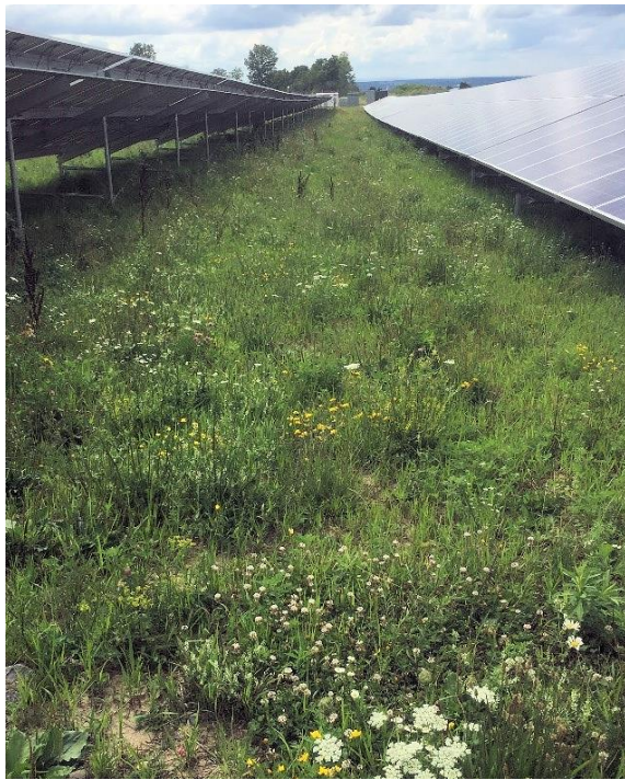
Figure 4. Vegetation management success.

28 th , 2018; no barber-pole worm-caused anemia was detected. Additional 5-point checks for internal parasites 4 were conducted throughout the grazing season and did not lead to concerns about internal parasites. There was no need to conduct fecal egg counts. The ewes' body condition scores remained stable throughout the season, suggesting adequate levels of intake and nutrients. No predator issues were recorded, the chain linked fence proved to be enough protection; no guard-animals were necessary. The sheep had access to water and sheep mineral ad libitum . The water was provided from water tanks that flowed into troughs (Figure 3). Rest periods for the grazed forage varied between 18 and 48 days for plots 1 and 2, and between 21 and 29 days for plots 3 and 4. The rest periods were chosen to be relatively short due to fast growing vegetation and the priority of preventing panel shading. Shade prevention and vegetation management was successful; at no time throughout the grazing season did the vegetation shade the panels (Figure 4).