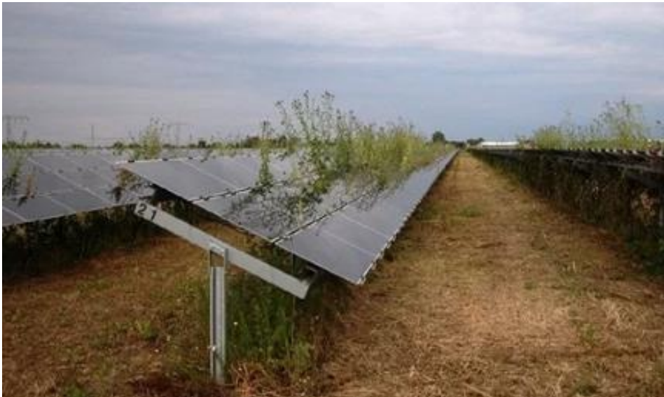
Figure 5. After mowing, prior to string trimming.

Grazing sheep on solar sites is a cost-effective method to control on-site vegetation and prevent panel shading (Figures 5 and 6). At no time in the growing season did vegetation shade the panels. It was less labor-intensive than traditional landscaping services and, thus, less expensive. The grazing trial at the Musgrave solar site was a full success for the site owners and operators, as well as the sheep farmer.