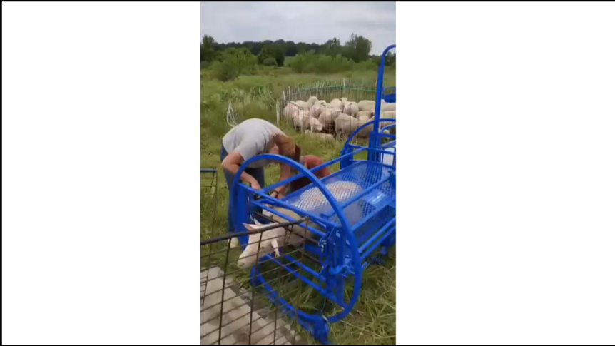
Holding Pen at Evans and Evans Farm in Andes, New York