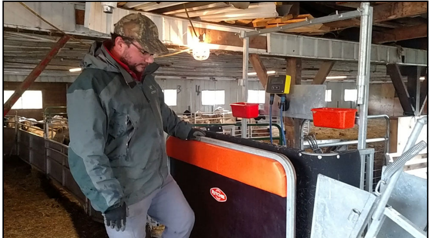
Ear tagging a sheep while in the Clamp