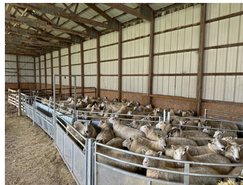
Sheep in tub with sweep gate about to enter the chute. Note guillotine gate at start of chute with rope that can be worked from the back of the tub.