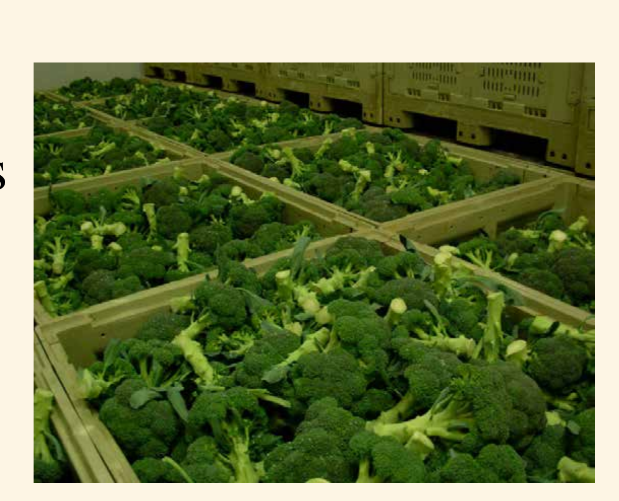
Virginia-grown broccoli is shipped to retailers in reusable plastic containers (RPCs).

We are working with distribution and retail partners to build acceptance for eastern-grown broccoli among produce buyers and consumers. Consumer surveys will provide feedback to broccoli breeders on the acceptability of various product attributes that may differ from western norms.