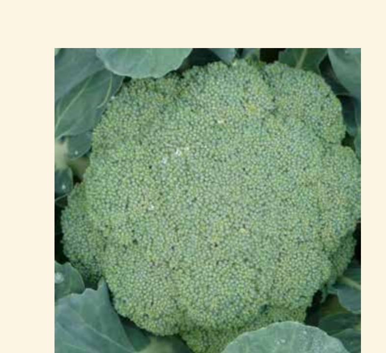
Our Solution: New breeding lines produce uniform buds despite high temperatures.

Public sector and commercial broccoli breeders are developing new hybrids that produce quality heads under hot and humid conditions typical of eastern summers.