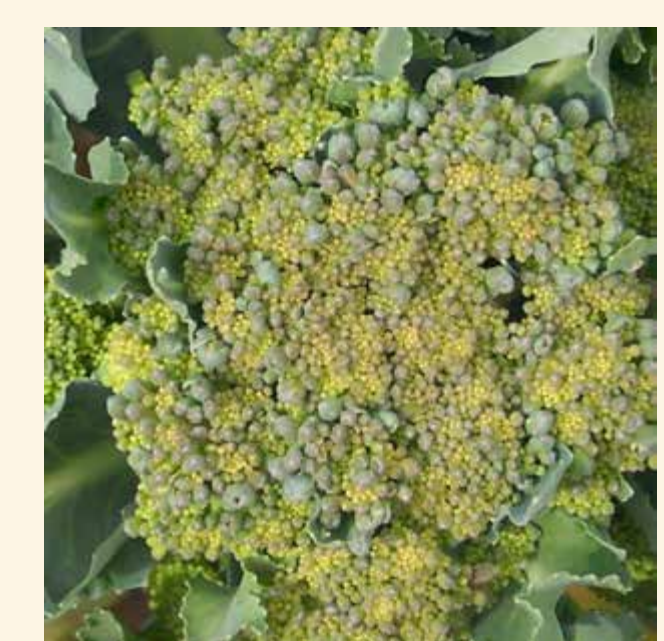
Current problem: Hot, humid conditions can lead to deformities in commonly grown commercial varieties.