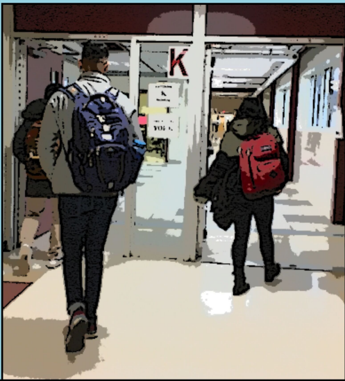
AFTER PRELIMINARY RESEARCH ON THE IHS DATABASES...