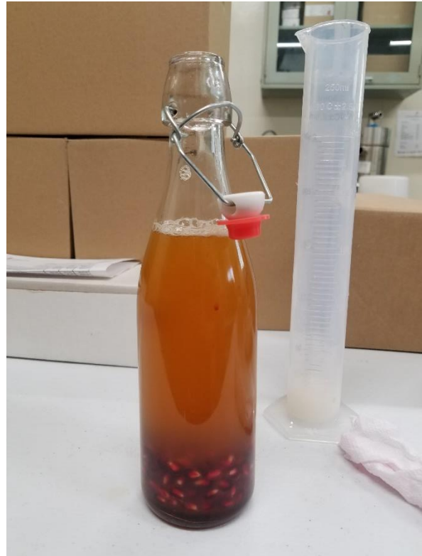
2 Pomegranate Kombucha prepared for secondary fermentation

Because there are so many possibilities for brewing kombucha, it is easy to be unique. As of right now, simply using maple syrup as the fermentable sugar will make your beverage stand out from the crowd. It's that easy.