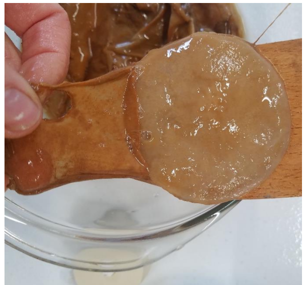
8. The yeast film is easy to peel away by hand, leaving behind an obviously paler surface.