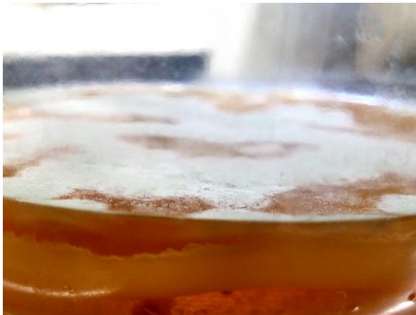
3. Another view to confirm mold – it only grows on top of the pellicle. It is raised, powdery, and scratches off easily with a fingernail. This example is actually a pellicle grown in a vinegar fermentation.