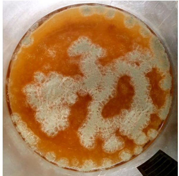
2. A moldy scoby, top view. Notice how the mold forms rosettes. Also note its powdery appearance and gray / green color. This batch and scoby should be thrown out.