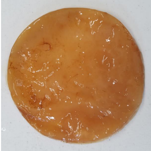
1. The underside of a normal healthy scoby. Notice the filaments of yeast forming on the left side of the image. This is very minimal and normal. Yeast can create a film that will cover the entire surface.