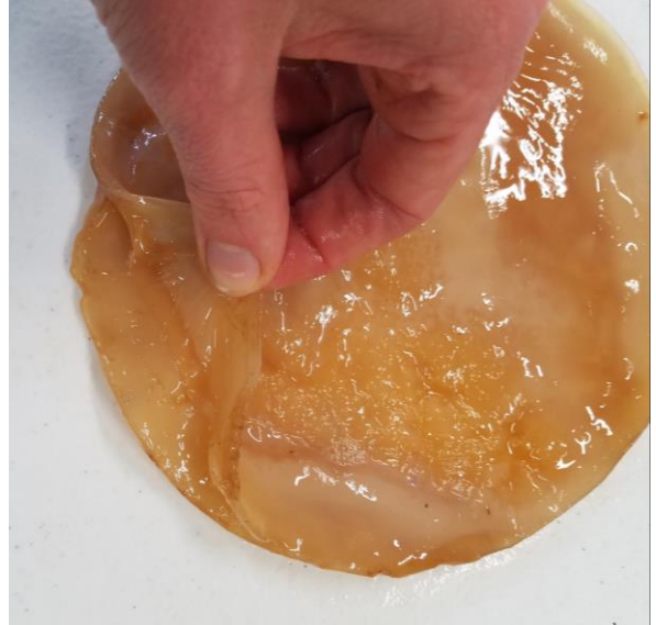
6. Peeling back the layers is easy. Sometimes there is yeast trapped between the layers causing dark patches. Every few batches it is best to remove the oldest layer to prevent the scoby from becoming too thick and “choking” your brew (excluding oxygen).