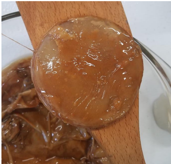
7. This scoby is covered with a thin film of yeast. This is the underside of the scoby.