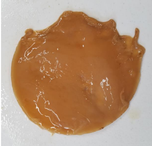
5. Though this scoby looks mangled, physical imperfections will not affect its performance.