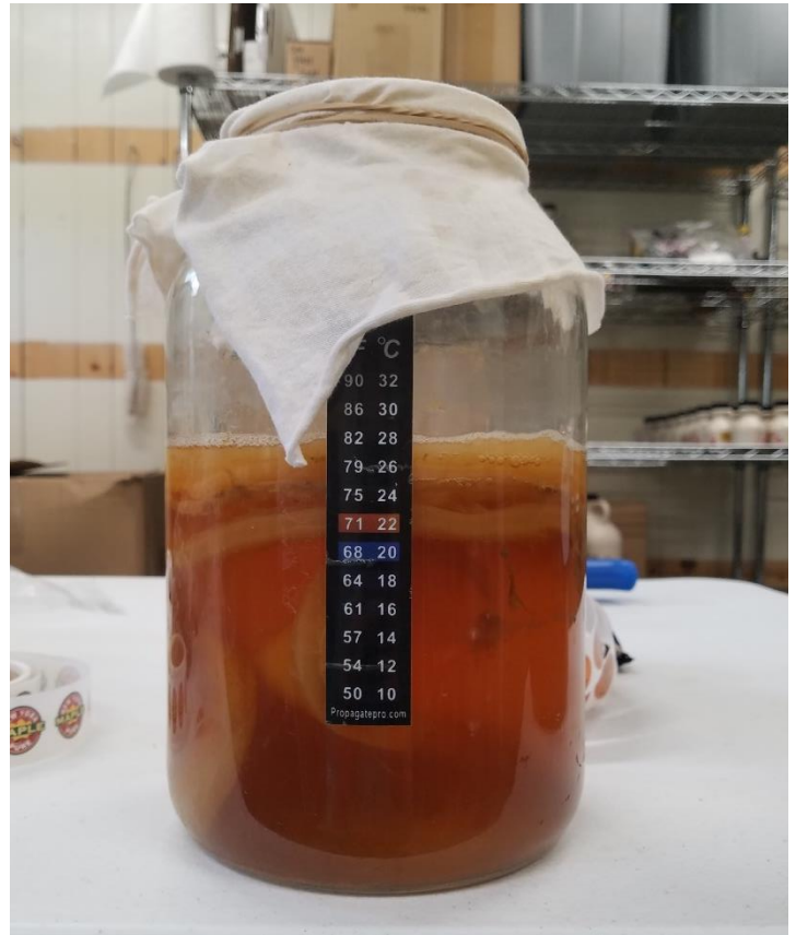
1 The Brewing Vessel

The consumer profile for this product gives maple producers a leg-up on the competition. Kombucha consumers are typically concerned with buying local and sustainably produced products, even more so than they are concerned with cost. Cane sugar, even when listed as “raw, organic”, simply cannot compete with pure maple. This is not just an assumption. We conducted surveys asking kombucha consumers their thoughts on informative product labeling. 100% of respondents said that they would be