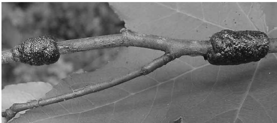
Forest Tent Caterpillar egg masses.

A longstanding question is the effects of forest tent caterpillar on maple syrup production. Surprisingly little research has been conducted on how defoliation affects either the quality or quantity produced. Defoliation reduces the production of current year resources and requires that the tree draw on reserves, which suggests that it must have some impact on syrup. An apt analogy might be withdrawing money from a retirement account to pay for house repairs. A good recommendation is that regardless of pre-defoliation stand health,