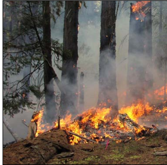
Prescribed fire in Sequoia National Park.

Fire hazard reduction drives biomass removal projects in most fire-adapted forests. The unprecedented scale and cost of recent wildfires across the Western U.S. have drawn public attention to the problem of unnaturally dense forests that may soon ignite. There is a widespread push to reduce fuels—live and dead biomass—that have accumulated during many years of fire suppression policies. In addition to the basic desire to reduce fire hazard, the case studies demonstrate the impact of fuels treatments on fire behavior, the importance of prescribed fire in maintaining fuel reduction benefits, and potential fire related co-benefits of biomass utilization.