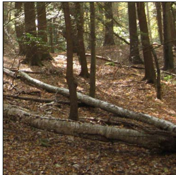
Coarse woody material in a hemlock/hardwood forest in Connecticut.

Minnesota's biomass guidelines present data that show soil nutrient capital is replenished in less than 50 years even under a whole-tree harvesting scenario (Grigal 2004, MFRC 2007). A study from Denmark indicates that harvesting of whole green trees can have a short term (four year)