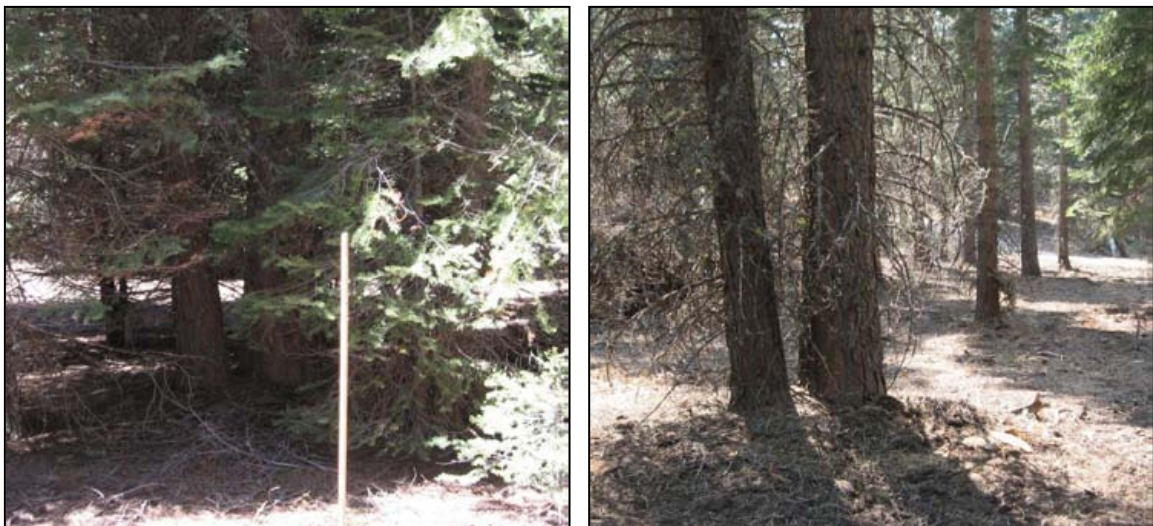
Before and after treatment at Lassen Volcanic National Park.