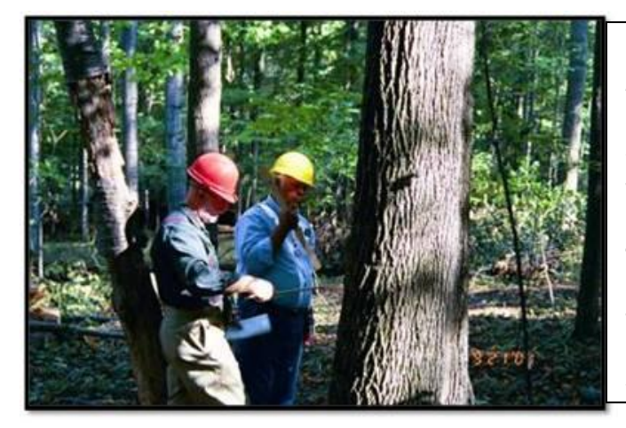
Foresters can be a valuable resource to implement silvopasture development and should be utilized for significant timber harvests

Complex thinning decisions can be eased by employing the help of trained professionals. Foresters are an invaluable resource to inform landowner decisions and effectively execute management plans. Most foresters will not be familiar with the concepts of grazing and livestock management, but they are experts in vegetation management. Care should be taken to choose a forester who is willing to work towards and interested in the silvograzier's goals. Some of the important expertise and services that foresters can provide are: tree selection for thinning operations; contract administration and supervision of harvests; identification of special resource concerns; sale of timber or contracting of work through a competitive bid process; tax planning for timber income; development of a (silvopasture) management plan; assistance with securing funding through grants and conservation programs; and the development of prescriptions and methods that are most likely to achieve management goals.