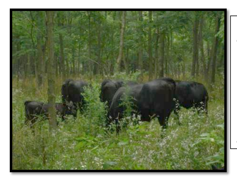
Left: Black Angus cow-calf pairs grazing in lush silvopastures in late-July. The diverse and abundant mix of vegetation beneath the tree canopy provides excellent grazing conditions during mid-summer conditions when the cool season forages in open pastures are largely dormant.

Other significant benefits from silvopasturing include the creation of diversified income sources, enhanced protection of riparian grazing areas, the creation of an aesthetically pleasing landscape, and possible qualification for tax abatement programs.