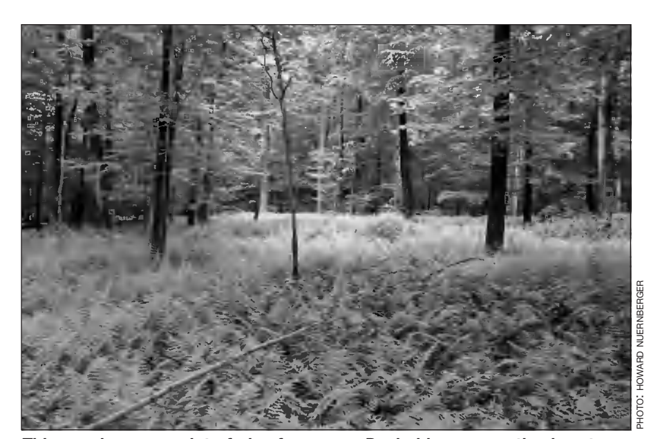
This area has severe interfering fern cover. Desirable regeneration is not likely to develop until the ferns are controlled.

Competing vegetation can prevent diverse and valuable forest regenera-