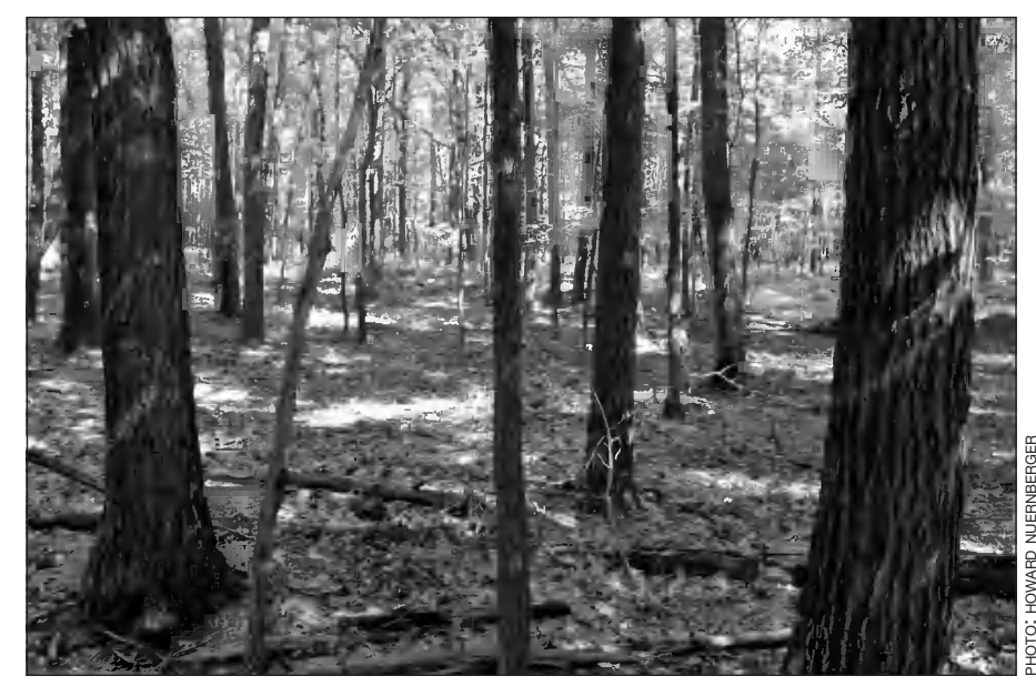
As forests mature and people begin to conduct harvests, potential regeneration problems need to be identified. This mature forest clearly lacks regeneration.