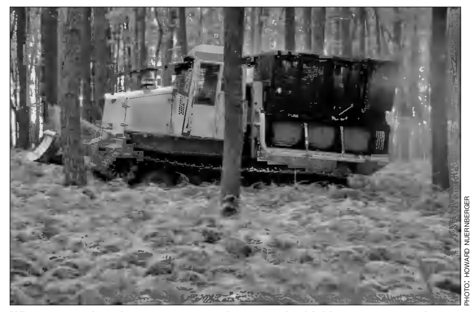
When competing plants cover extensive areas, herbicide treatments using track-mounted mist blowers are most effective when applied prior to harvesting timber.

tion as well as the establishment of desirable nonwoody plants, such as native wildflowers, forbs, and herbs. If competing plants are present and left untreated in an area that you propose to harvest, they may become your next crop. Timber harvesting will increase light on the forest floor and magnify the problems caused by competing plants. It is not uncommon in Pennsylvania to see forest understories filled with competing plants.