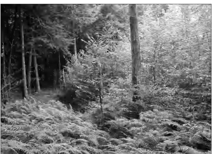
Forest regeneration inside versus outside a fence. Research demonstrates that high deer impact inhibits forest regeneration.

In many areas, deer have reduced seedling numbers, shifted tree species composition to less desirable species, and slowed the growth of surviving seedlings. Research has shown that when the deer population density exceeds what the land can support, forest regeneration suffers. In regions of the state where decades of overbrowsing have severely depleted the habitat, even relatively few deer can have significant effects.