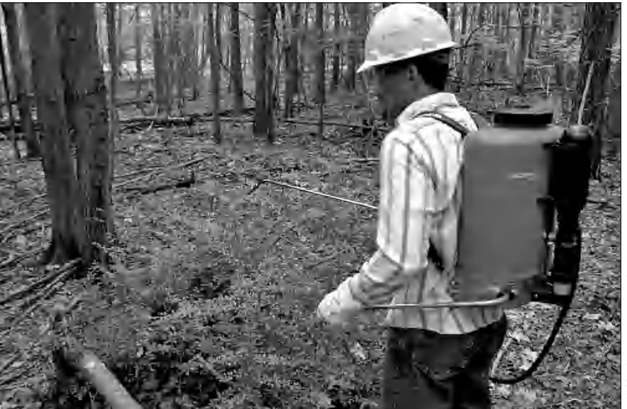
Hand application of herbicides are appropriate for small areas or when treating individual invasive or competing plants.