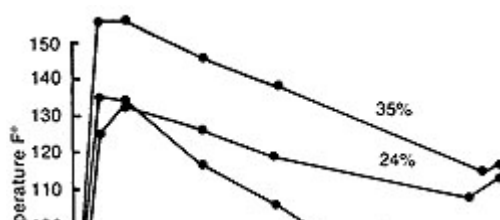
Figure 1 Effect of percent moisture at baling time on heat retention in big bales.

When hay is baled, it should not be higher than 18 to 22 percent moisture. At higher levels of moisture, bales lose large amounts of dry matter (Figure 1) caused by excessive heating and molding (Figure 2). In severe cases, spontaneous combustion is possible.