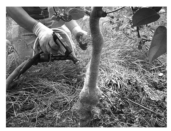
Fig. 2. Application of EVA barriers using a hot-melt spray gun, North Huron, NY.

planted in 2004, 4.2 cm trunk diameter at 30 cm height; Lummisville, mixed varieties on M.9 rootstock, planted in 2007, 3.7 cm trunk diameter at 30 cm height; Hilltop, mixed varieties primarily on B.9 rootstock, except for one variety (Braeburn) on M.26 rootstock, planted in 2002, 5.7 cm trunk diameter at 30 cm height.