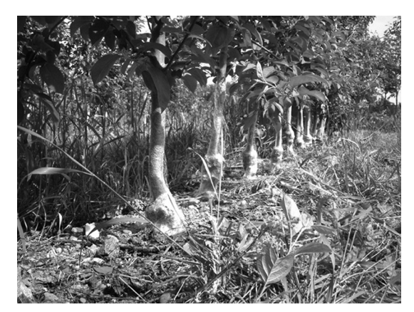
Fig. 1. Apple tree trunks covered by nonwoven EVA fiber barriers, North Huron, NY.

which entails considerable labor and potential for worker exposure.